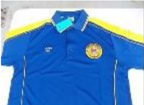
Men's Polo Shirt Grace Portland 1225 $40.00