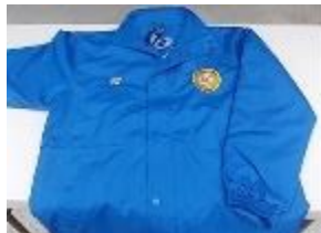
Heavy Duty Stadium Jacket $70.00