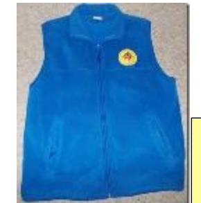
JB Polar Fleece Vest KB 30V $35.00

Club Decal sheets 1 large badge & 2 smaller badges. $10.00 per sheet.