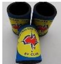
Stubby Holder $6.00

Club Decal sheets 1 large badge & 2 smaller badges. $10.00 per sheet.