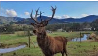
Red Stag Deer & Emu Farm