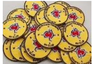
Iron on Cloth Badge $5.00