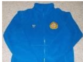
JB Polar Fleece Jacket $40.00