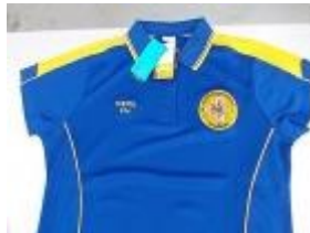
Ladies Polo Shirt Grace Fairlady 1220 $40.00