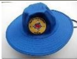
Broadbrim Hat with badge $20.00