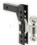
50/70mm ball combo

What rating tow bar was fitted also, can be a concern as the actual towing capacity of any vehicle is that of the lowest rated component. The vehicle itself, the tow bar, the tow tongue, and the actual ball or hitch.