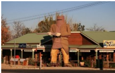
Glenrowan & Ned Kelly Country