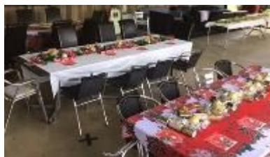
The Ladies preparing the feast and laying out of tables.