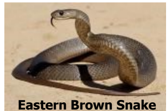
Eastern Brown Snake

All snake venom is made up of huge proteins (like egg white). When bitten, a snake injects some venom into the meat of your limb (NOT into your blood).