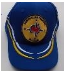
Cap with badge 4075 $20.00

Contact Merchandise Officer to obtain postage costs. Cheque or money order payments—please phone for new account name and postal address.