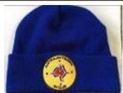
Wool Beanie with badge $16.00