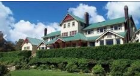
Mount Buffalo Chalet