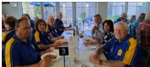
Dining in salubrious surroundings.

That evening, it was off to the Jurien Bay Hotel for dinner.